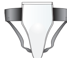
Figure 3 - Female Groin Guard Front View