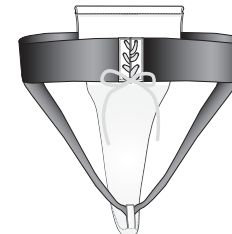
Figure 4 - Female Groin Guard Inside View